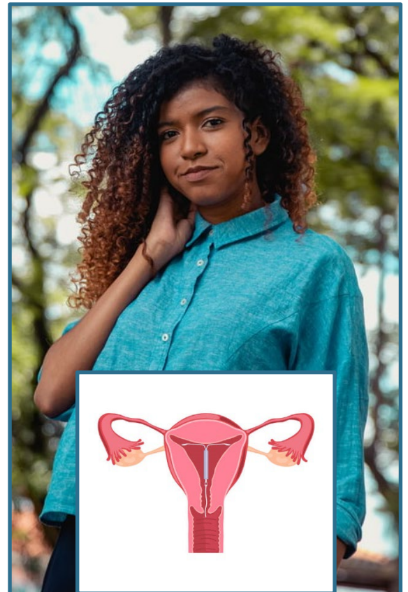
This IUD is placed in the uterus.