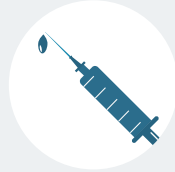
Birth Control Shot