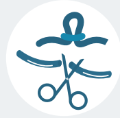
Permanent Birth Control (Tubal Ligation & Vasectomy)