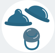
Diaphragm, Cervical Cap, & Sponge