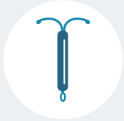
Intrauterine Device (IUD)