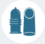
External & Internal Condom