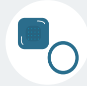
Birth Control Patch & Vaginal Ring