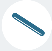
Birth Control Implant