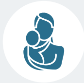
Lactation Amenorrhea Method