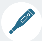
Fertility Awareness Methods