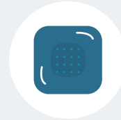
Birth Control Patch