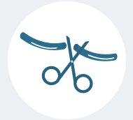
Permanent Birth Control (Vasectomy)