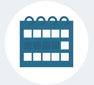
Natural Family Planning Methods