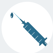
Birth Control Shot