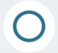
Birth Control Vaginal Ring