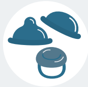
Diaphragm, Cervical Cap, & Sponge