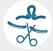
Permanent Birth Control (Tubal Sterilization & Vasectomy)